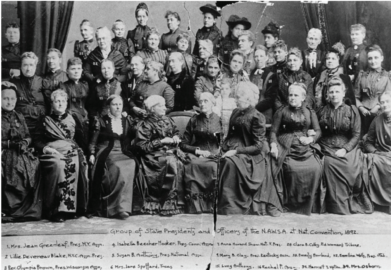
Group of State Presidents and Officers of the N.A.W.S.A. at National Convention, 1892.