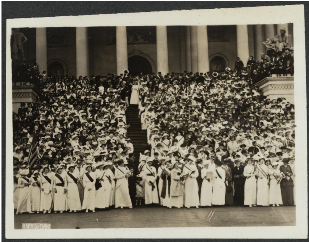
Nationwide demonstrations were held on May 2nd in support of a federal amendment. Envoys from these demonstrations brought petitions to Washington D.C. on May 9th and carried them in procession to Congress. Five thousand women convened on the U.S. Capitol steps singing.