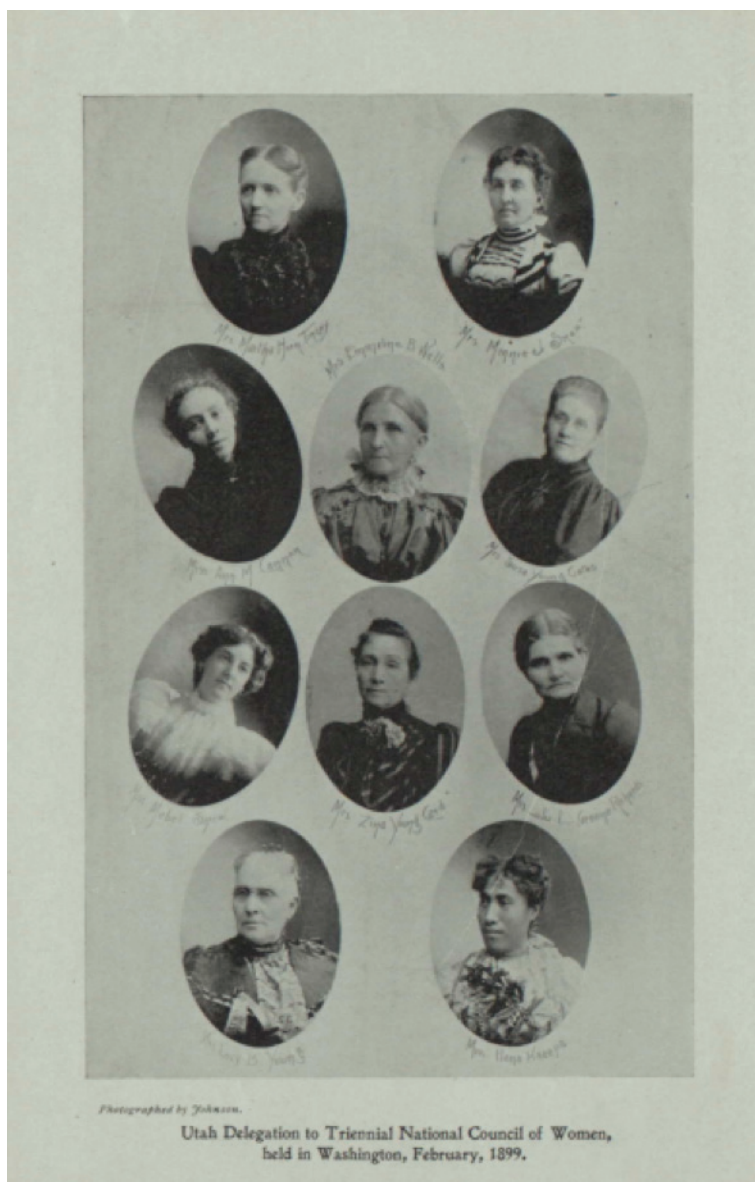
Utah Delegation to Triennial National Council of Women, held in Washington, February 1899.