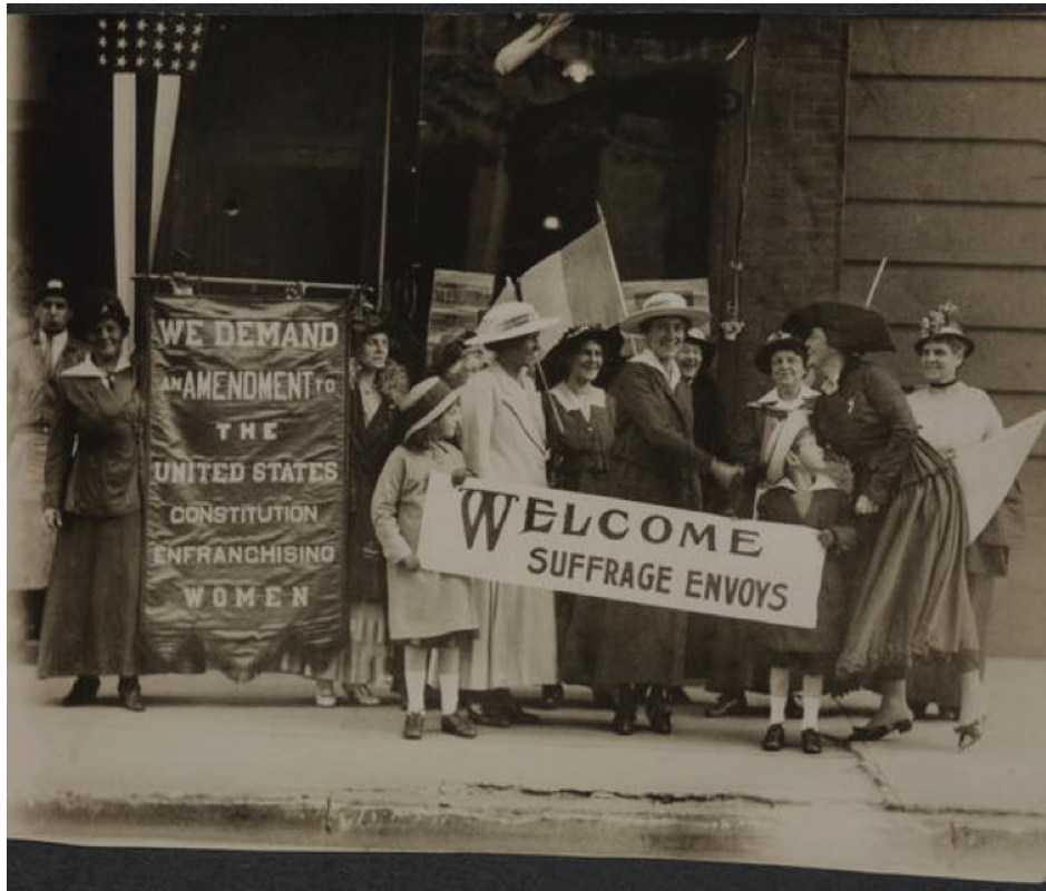
Suffrage envoys from San Francisco greeted in New Jersey on their way to Washington to present a petition to Congress in 1915. This envoy contained more than 500,000 signatures.