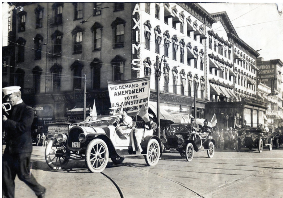
Envoy to Senator Smoot of Utah by delegation of Utah women voters. Parade coming up Main Street, Salt Lake City, on way to interview the senator - 1915.